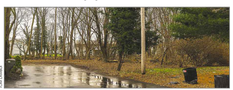
Developer continues push for Port Jefferson Station complex despite opposition.

"There might be a change of heart," she said. "I expect to have a robust discussion.