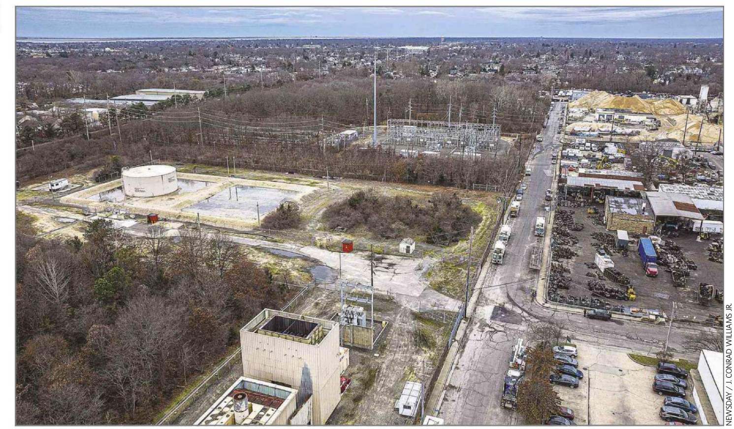
An aerial view of the open site at the corner of Bahama and Henry streets, where a battery storage facility could go. Video: newsday.tv