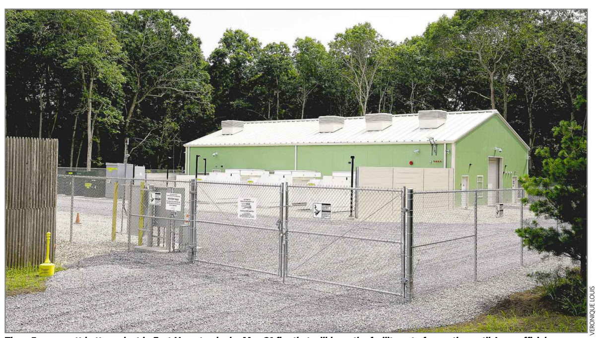
The a 5-megawatt battery plant in East Hampton had a May 31 fire that will keep the facility out of operation until June, officials say.

the inability of some contractors to test for lithium, though ultimately they did test for lithium.